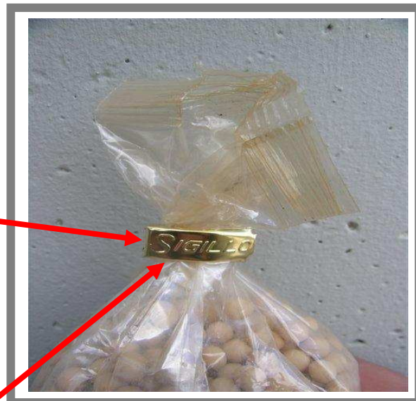
BRASS PLATED STEEL