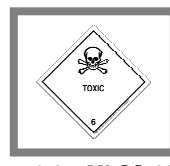
6.1 – MLSS 18