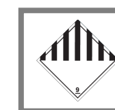
9.1 – MLSS 20