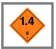
1.9 – MLSS 2E