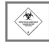
6.2 – MLSS 30