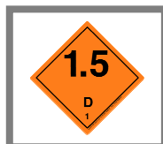
1.5 – MLSS 4