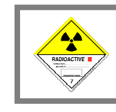
7.3 – MLSS 45