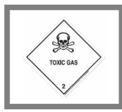
2.3 – MLSS 7