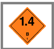
1.6 – MLSS 3B