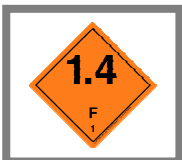
1.4 – MLSS 3F