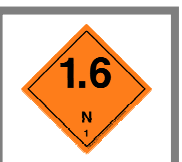
1.2 – MLSS 2N