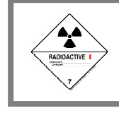
7.2 – MLSS 31