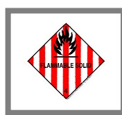
4.1 – MLSS 12