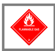
2.1 – MLSS 9