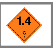
1.10 – MLSS 2G