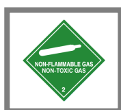
2.2 – MLSS 8