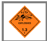
1.3 – MLSS 2B