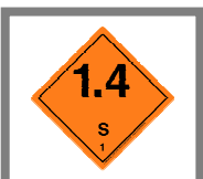
1.11 – MLSS 2S