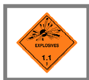
1.1 – MLSS 2