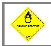
5.2 – MLSS 19