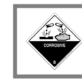
8.1 – MLSS 23