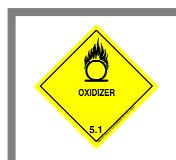
5.1 – MLSS 15