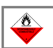
4.2 – MLSS 13