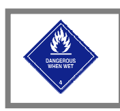
4.3 – MLSS 14