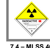
7.4 – MLSS 46