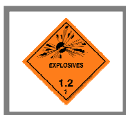
1.2 – MLSS 2A