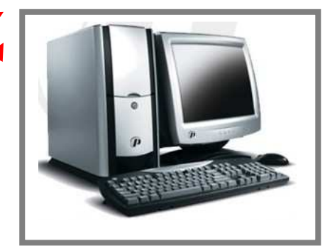
IN THE EVENT OF OPENING AN SMS ALERT IS SENT TO YOUR MOBILE OR PC